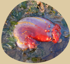
Sea Apple Sea Cucumber