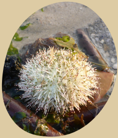
White Salmacis Sea Urchin

Sea urchins are the porcupines of the sea. Usually ball-shaped and covered with spines, these small creatures can cause great pain if you accidentally touch or step on them. Their spines are sharp enough to puncture your skin, and can break off and be embedded inside your body.