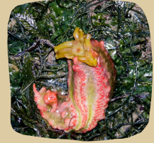
Pink Warty Sea Cucumber

Sea cucumbers are soft and sensitive, but they are known for having a strong defensive mechanism. They can vomit out their internal organs, and become very sick. Some species like the Pink Warty Sea Cucumber and the Sea Apple Sea Cucumber also expel toxic substances when stressed.