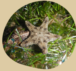
Biscuit Sea Star

Sea stars are intricate animals with thin tissue around their feet to help them breathe in the water. Do not lift the sea stars out of the water for long periods of time as they will suffocate, and be careful as our touch can easily harm their fragile structures.