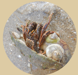
Orange-striped Hermit Crab

Hermit crabs are not true crabs as they do not grow their own shells. Instead, they protect themselves using empty shells of other animals like snails. As they grow bigger, they will discard their current shells in search of larger ones. It is important that we do not collect shells on the shore as they might be potential homes for the hermit crabs.