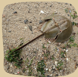
Coastal Horseshoe Crab

Horseshoe crabs are ancient arthropods and their name is derived from the horseshoe shape of their carapace. The horseshoe crab's tail, also known as the telson, may look scary but it is actually harmless. If you come across one that is upside down and struggling to flip itself over, give it a helping hand!