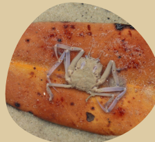
Leaf Porter Crab

There exists thousands of species of crabs, making them an incredibly diverse group of animals. Small crabs only grow to about 3 cm in body width, and it can be fun to watch them scurry around. Larger crabs, on the other hand, may exhibit aggression and deliver a painful pinch if you go too close to them. Certain crabs such as the Mosaic Reef and Red Egg Crabs are toxic, as their diets include saponin-producing sea cucumbers, and would prove fatal to humans if consumed.