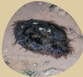
Hairy Sea Hare

Sea hares may look like alien blobs but they are actually sea slugs! They have two rabbit-like tentacles which provide them with a keen sense of smell. Touching them causes extreme stress, and sea hares will expel a purple, sticky slime as a defense mechanism.