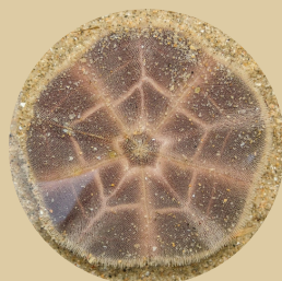
Cake Sand Dollar

Sand dollars appear flat and lifeless, but they are animals that are closely related to sea urchins. They resemble dollar coins, hence their name! Their bodies are stiffened with spines which help them to move. Do take note of where you step as they can be really fragile!