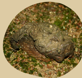
Hollow-cheeked Stone Fish

Stone fish are one of the most venomous fish in the sea. They are masters of camouflage and extra precaution is required to avoid them in the intertidal area. When stepped on, some stone fish possess spines that will inject a painful venom and can sometimes be fatal.