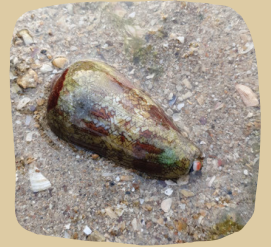
Textile Cone Snail

Cone snails come in a wide variety of sizes and beautiful shell patterns. However, don't let its appealing appearance fool you as they can deliver dangerous venom in a harpoon-like manner. Their stings have been known to be fatal to humans and these creatures should never be touched.