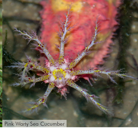
Pink Warty Sea Cucumber