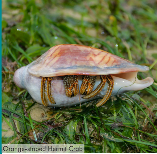
Orange-striped Hermit Crab

Plan your trip and keep within 2 – 3 hours so that your exploration is not interrupted by the rising tide.