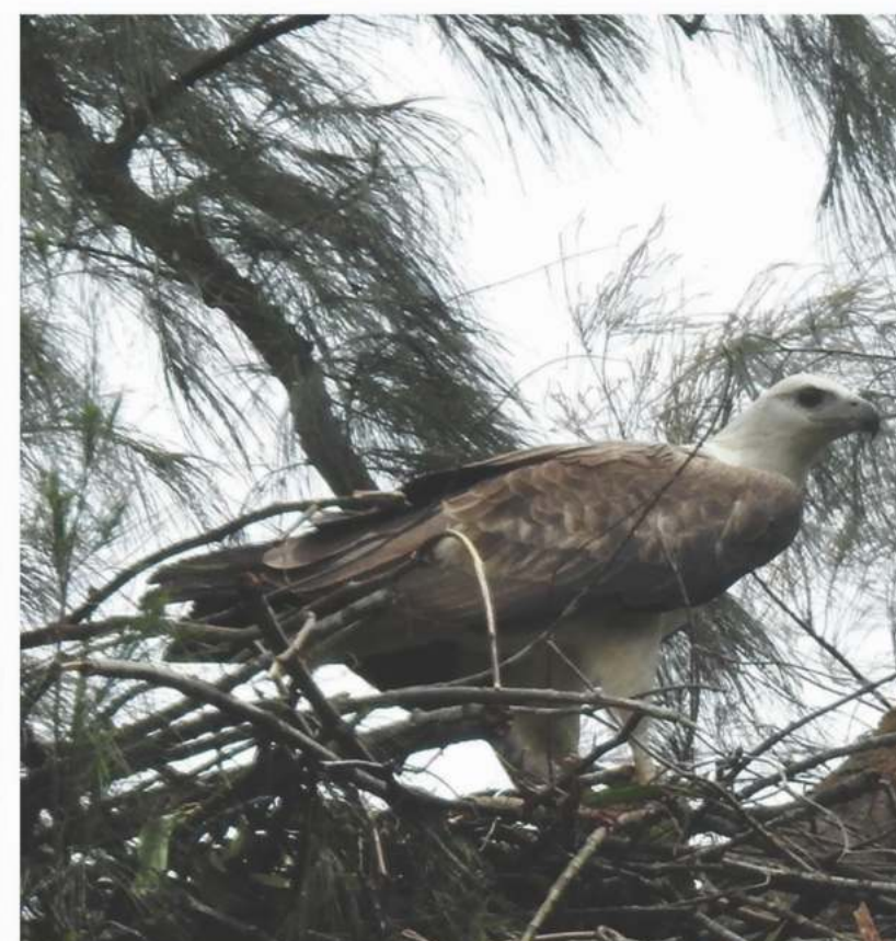
White-bellied Sea Eagle ( Haliaeetus leucogaster )