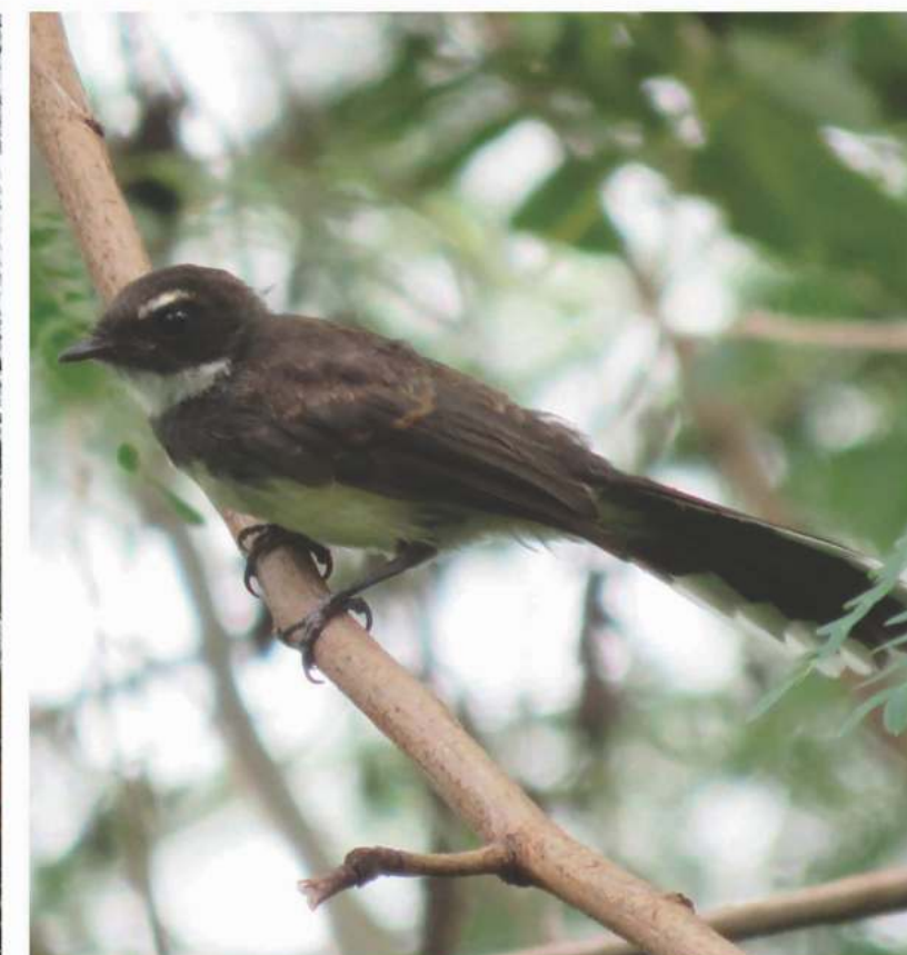
Pied Fantail ( Rhipidura javanica )