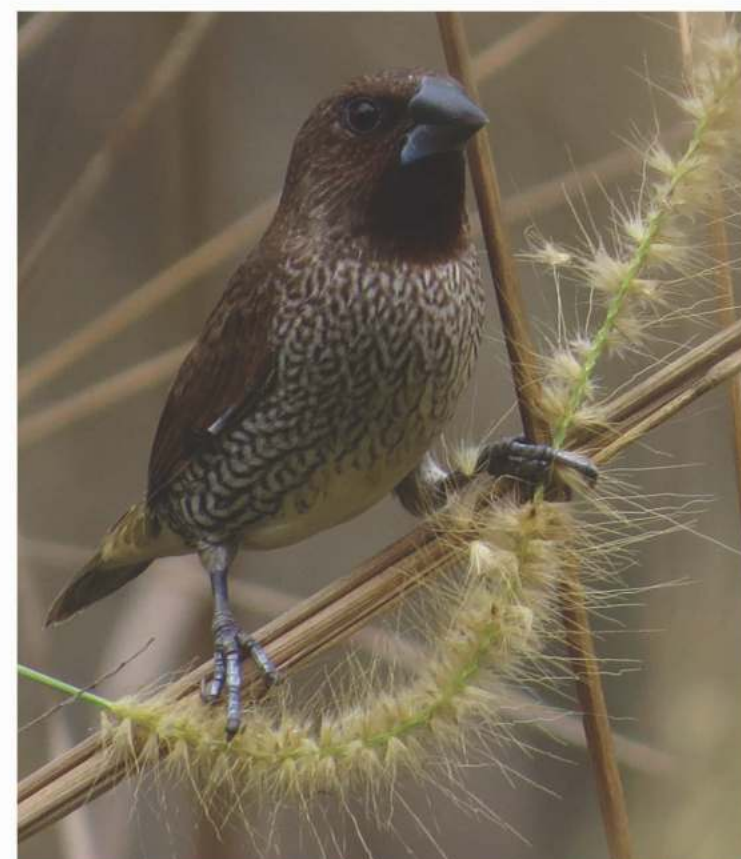
Scaly-breasted Munia ( Lonchura punctulata )