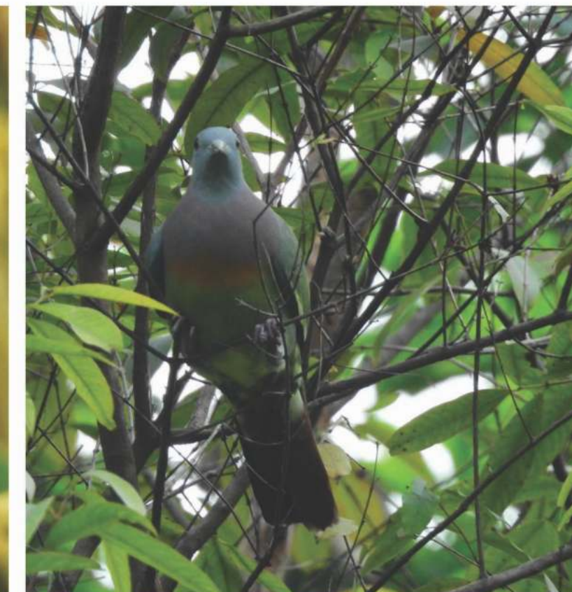
Pink-necked Green Pigeon ( Treron vernans )