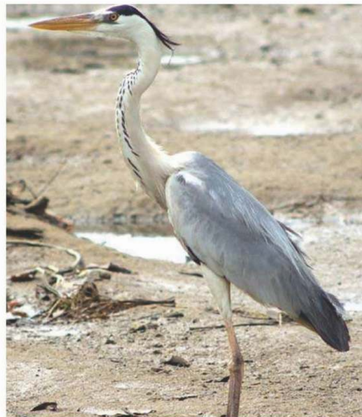
Grey Heron ( Ardea cinerea )