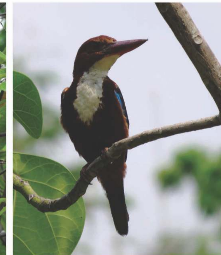
White-throated Kingfisher ( Halcyon smymensis )