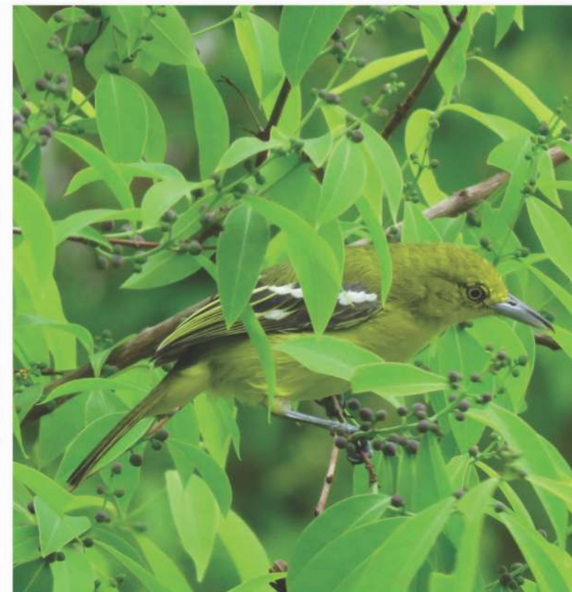
Common Iora ( Aegintha tiphia )