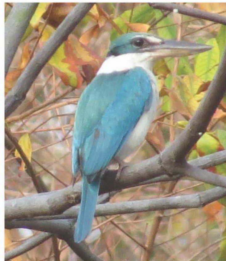
Collared Kingfisher ( Todiramphus chloris )