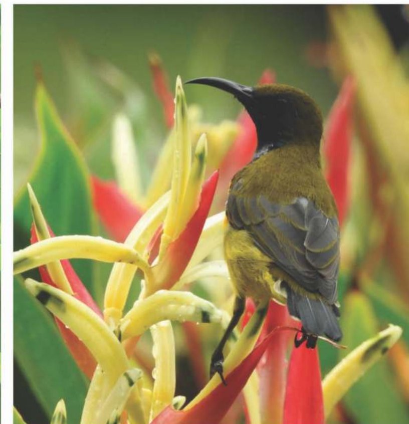
Olive-backed Sunbird ( Nectarinia jugularis )