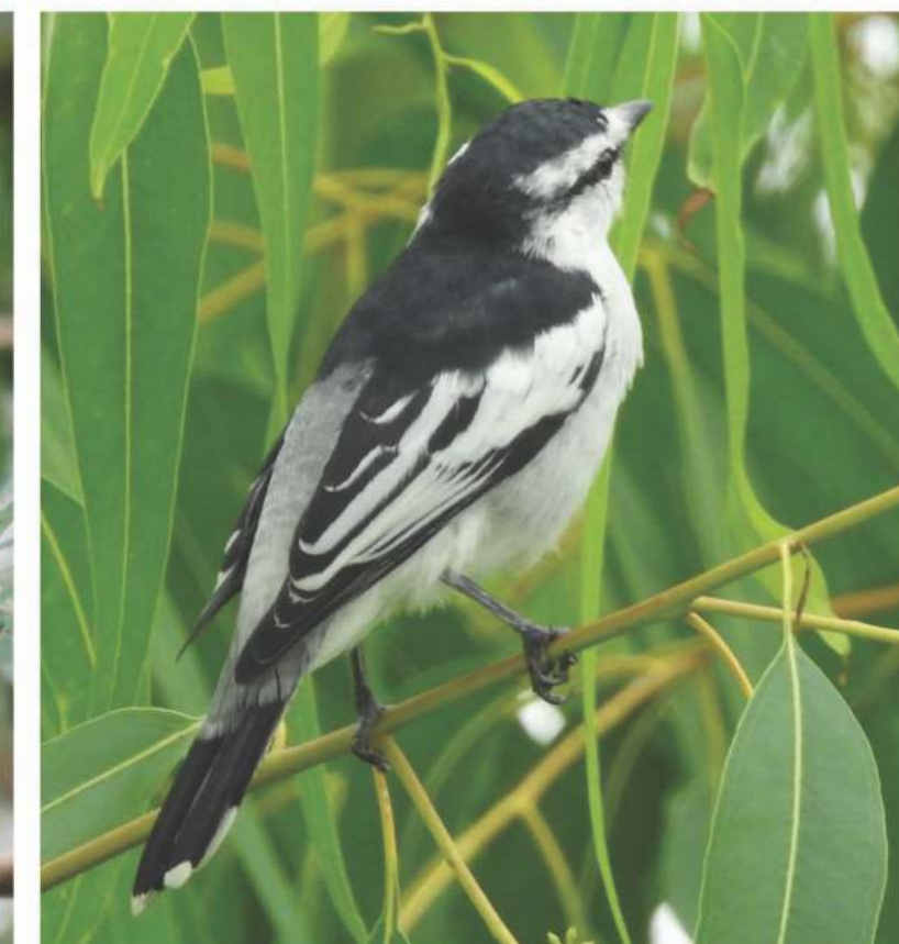
Pied Triller ( Lalage nigra )