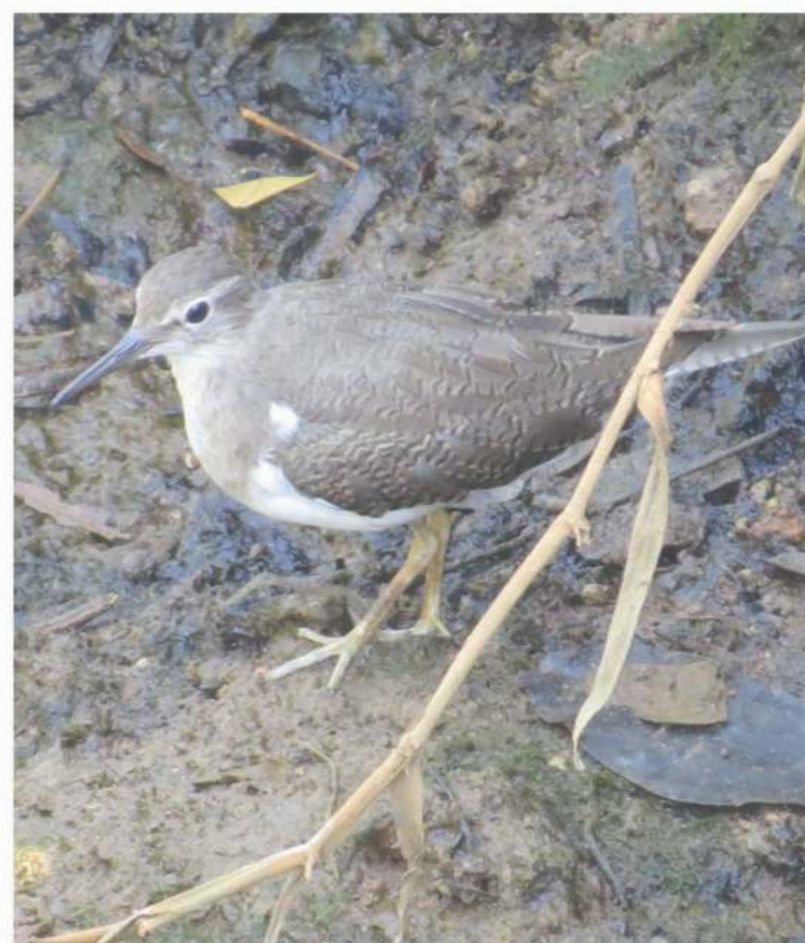
Common Sandpiper ( Actitis hypoleucos )