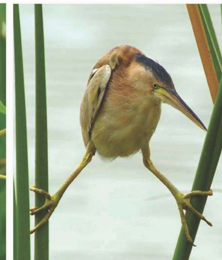
Yellow Bittern ( Ixobrychus sinensis )