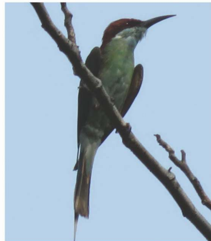
Blue-throated Bee-eater ( Merops viridis )

For more information about Singapore's biodiversity, please visit NParks Flora&Fauna Web at florafaunaweb.nparks.gov.sg