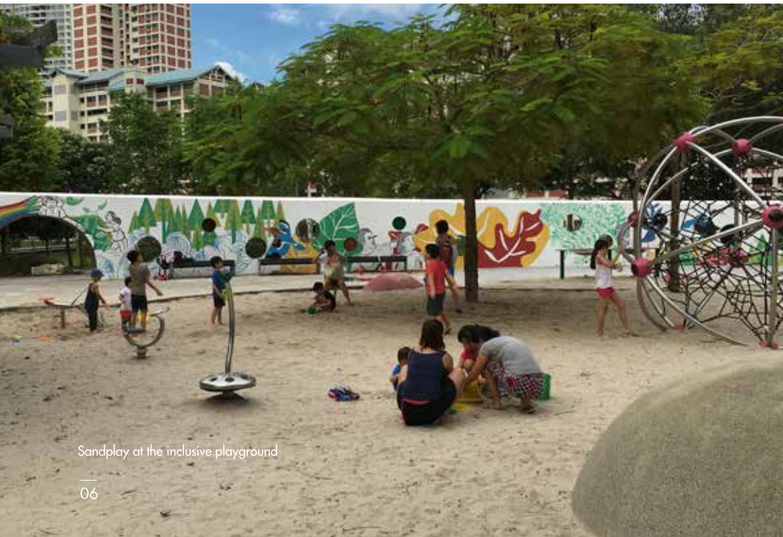
Sandplay at the inclusive playground