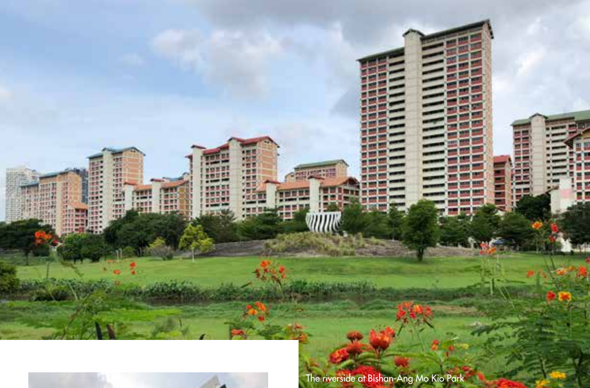
The riverside at Bishan-Ang Mo Kio Park