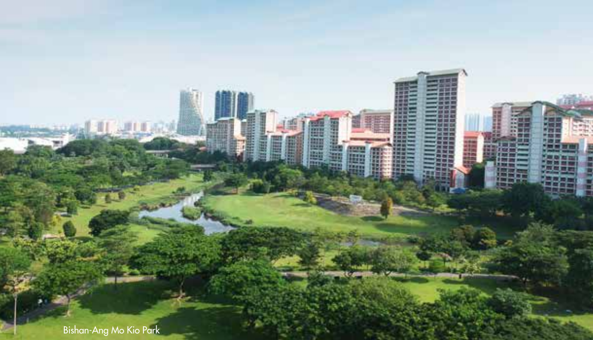
Bishan-Ang Mo Kio Park