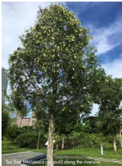
Tea Tree ( Melaleuca cajuputi ) along the riverside