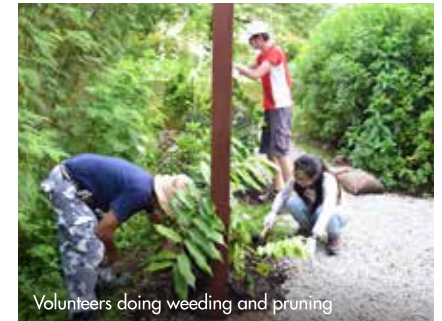
Volunteers doing weeding and pruning