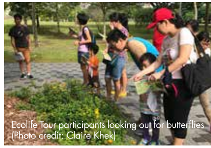
Ecolife Tour participants looking out for butterflies

Spanning a total of 0.3 hectares, the Community and Herb Gardens at Bishan-Ang Mo Kio Park were established more than 20 years ago. They house many types of edible, ornamental plants and herbs with traditional and medicinal uses. Situated just a stone's throw away from Bishan Road, they are maintained by passionate volunteer gardeners. Since 2014, the gardeners of the Herb Garden have participated in the biennial NParks' Community in Bloom Awards, and the Herb Garden received a Gold Award in 2018.