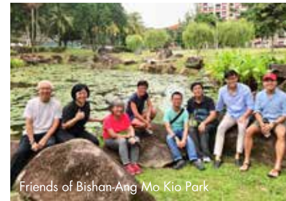
Friends of Bishan-Ang Mo Kio Park