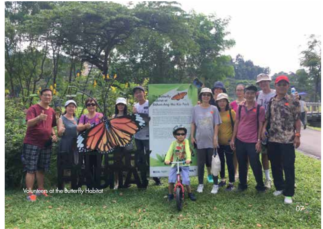
Volunteers at the Butterfly Habitat