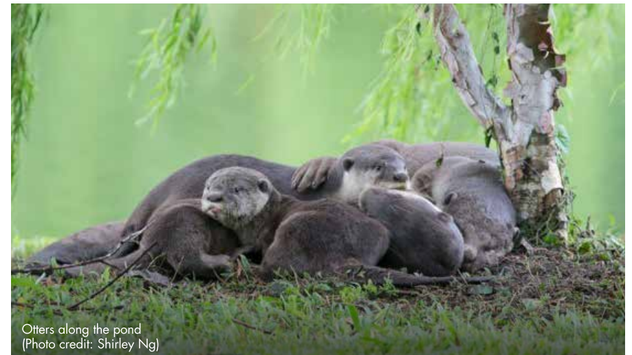
Otters along the pond

In 2015, a family of Smooth-coated Otters ( Lutrogale perspicillata ) started appearing in the park. They can be sighted in the park occasionally, travelling upstream to Lower Peirce Reservoir Park and downstream to Marina Barrage. They are usually seen feeding at the Landscape Pond in the Pond Gardens.