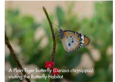
A Plain Tiger butterfly ( Danaus chrysippus ) visiting the Butterfly Habitat

On 24 July 2015, 100 young environmentalists from Southeast Asia, Singapore students, and representatives from APRIL Group and NParks enhanced the Butterfly Habitat. This butterfly habitat enhancement project is part of APRIL Group's five-year sponsorship of S$100,000. The size of the habitat was increased from 260 sqm to 500 sqm after enhancement. The Butterfly Habitat is currently maintained by volunteers.