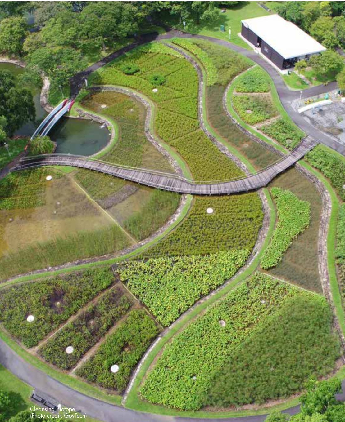
Cleansing Biotope