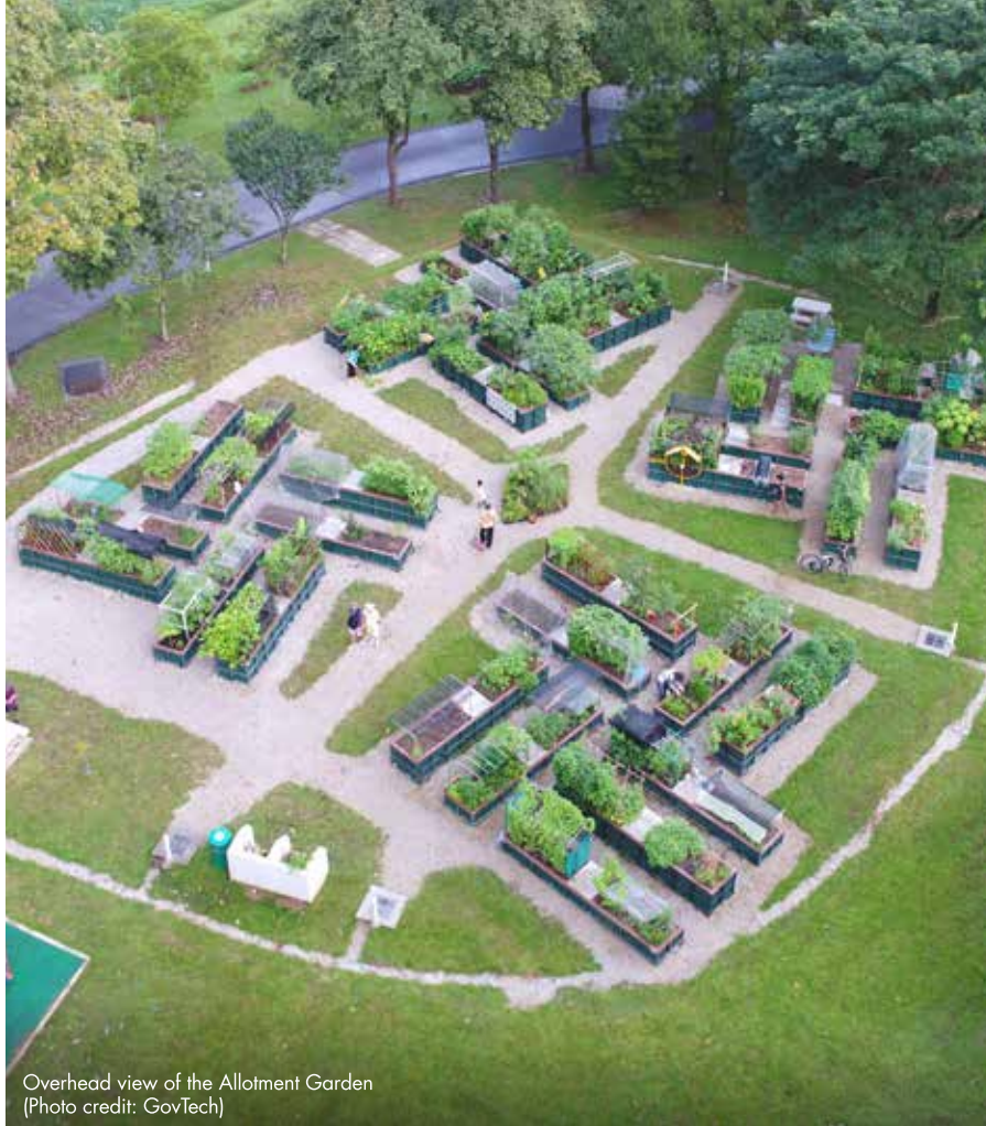
Overhead view of the Allotment Garden