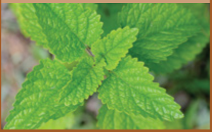
Lemon Balm Melissa officinalis