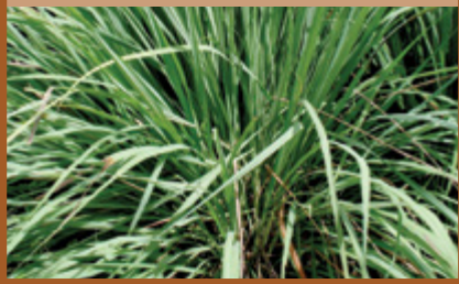
Lemon Grass Cymbopogon citratus