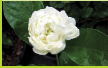
Rose Jasmine Jasminum sambac 'Grand Duke of Tuscany'