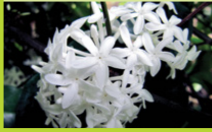
Kanwene Pleiocarpa mutica