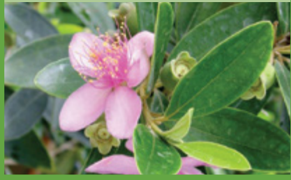
Rose Myrtle Rhodomyrtus tomentosa