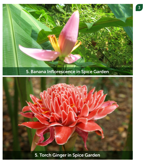
5 Spice Garden and Ancient Garden

Look carefully at the architecture of the keramat with a 14th-century Malay roof called a pendopo . A fighting cock motif of Javanese origin is carved onto the 20 wooden pillars holding up the roof.