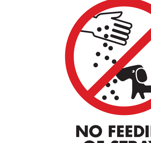
NO FEEDING OF STRAYS