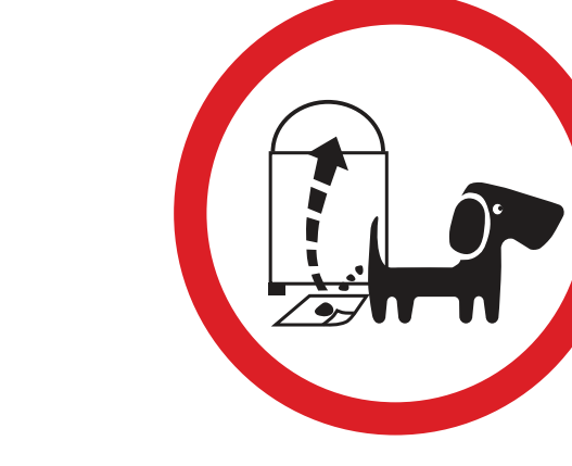
CLEAN UP AFTER YOUR DOG