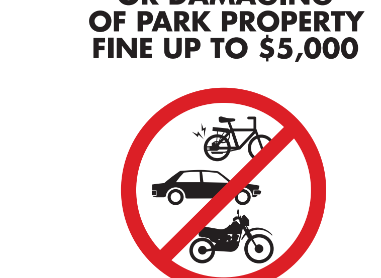
NO UNAUTHORISED VEHICLES