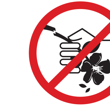
NO PLUCKING OF PLANTS