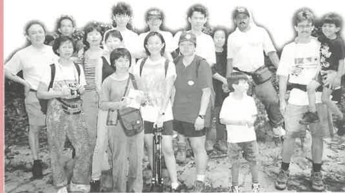
Taking a breather

With much heaving and panting, we managed a steep rocky path. Lactic acid had started accumulating in our muscles and we decided to take a break and to have a group picture taken.