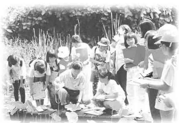
So that's what a lotus looks like!

To address these issues and to bring children closer to nature, one-day nature workshops based on the theme, "Adaptation in Nature" were conducted on 3 & 5 June for the 11 to 12 year olds.